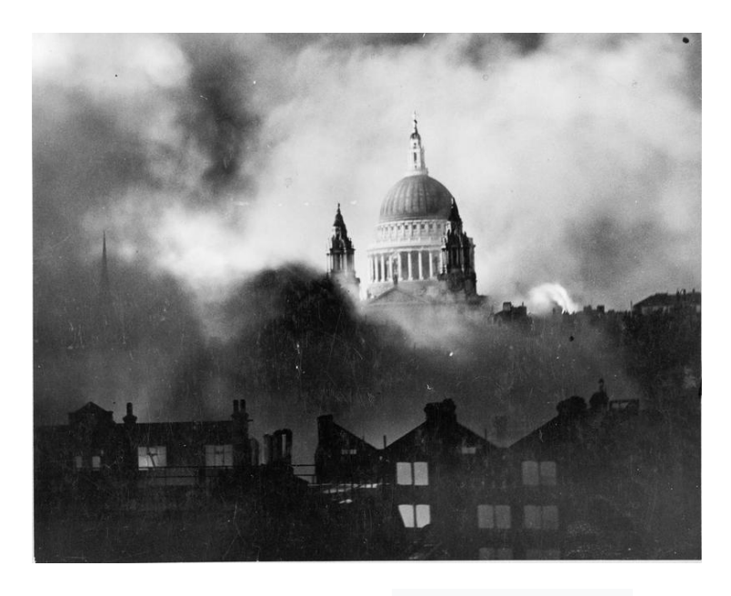
Herbert Mason, St Paul's Survives, 29/30 December 1941

During the Second World War air raid protection assets were prioritised in order to safeguard Saint Paul's Cathedral from destruction by aerial bombardment. Herbert Mason's iconic photograph of the dome rising above the burning City of London became synonymous with the Ministry of Information's propaganda strap line: 'London can take it!'